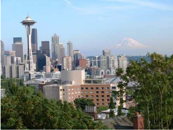
Downtown Seattle, Mt Rainier in distance

Whilst we would probably have gone to the convention wherever it was held, I have to admit that the fact that it was in Seattle, the "Emerald City", was a draw for us. This was not because the north-west of the USA is big cactus country, it is not, but because we had not been that area before. I was reminded on the flight out how curious it is to leave at 4pm and land one hour later, local times. Long day - sort of time travel. First plane I have been on where I could choose my own film etc from a large list, and have it relayed to my own personal screen.