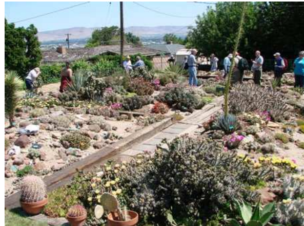
Ron McKitrick's garden

very sudden change in vegetation as we went down onto the plains; the area is classified as a cold desert. In the morning we visited the outstanding collection of Ron McKitrick that is planted out in ten large garden beds. Ron started with one greenhouse, then built another, then started experimenting with plants in the open, to see what would survive year-round.