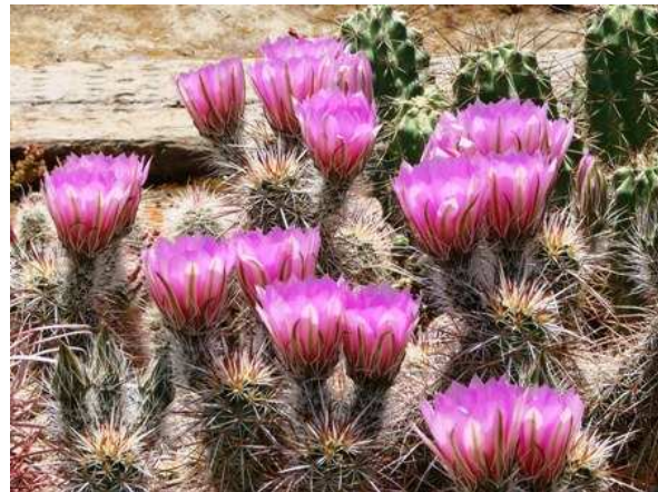
Echinocereus in flower in McKitrick's garden.

Monday 4th June. Flight home. I was not sleepless in Seattle, but I was on the 9 hour flight back. What with that and the eight hour time jump forward, local time, I was jet-lagged until mid-day Wednesday.