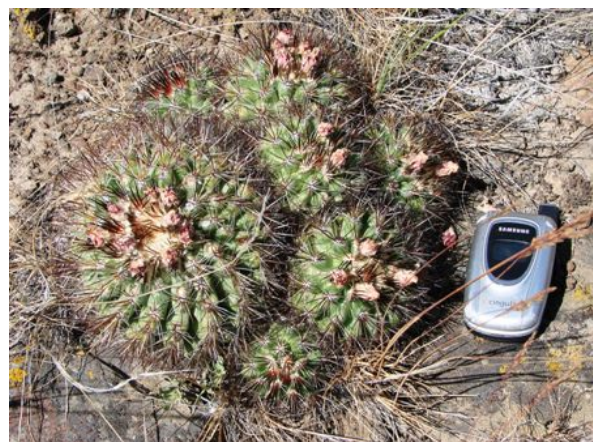
Pediocactus simpsonii var. robustior

In the afternoon we went to a habitat of Pediocactus simpsonii in a wildlife area near Ellensburg, in the foothills of the Whiskey Dick mountain. None were still in flower (it flowers in April), but we found a large number of fine plants to photograph. Somebody with tweezers gave me a capsule of seed that he had "rescued". The locals say that it is the variety robustior .