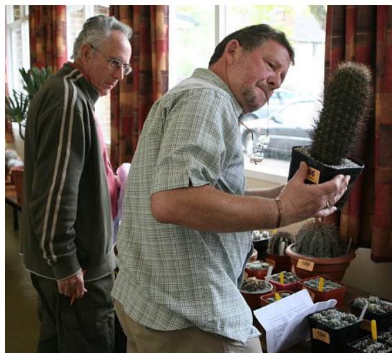
Oxford's Auction – Setting up

So this year everything was reciprocated. Northampton held their first Auction in April. (It should be explained that there are two kinds of cactus auction: the first is occasioned usually by the death of a member, so that it has to be organised quickly but the plants are to hand and can be listed in a single operation; the second is where the organisers invite contributions. This requires a lot of forward planning, advertising, and the slow accumulation of catalogue entries. Our own experience is that the main building blocks should be in place by Christmas. These include booking a hall, getting listed on the BCSS Events Programme, advising local branches, and providing forms for sellers to submit their plants.)