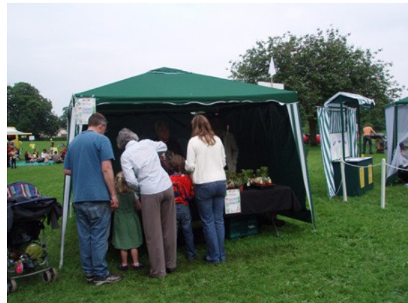
Sales in full swing