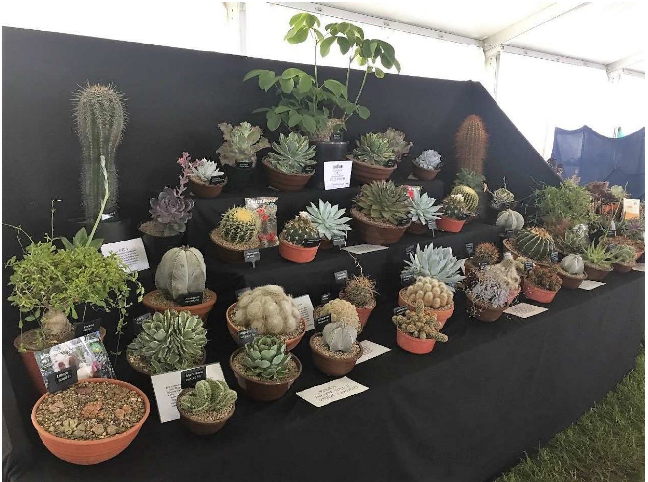
Picture of Oxford Branch's Gold Award stand