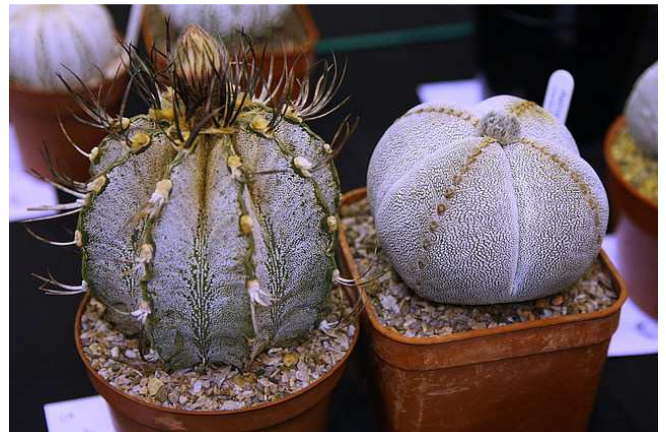
Astrophytum capricorne / Astrophytum myriostigma 'Onzuka'