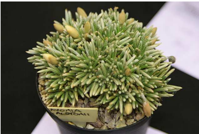
Avonia quinaria ssp. alstonii