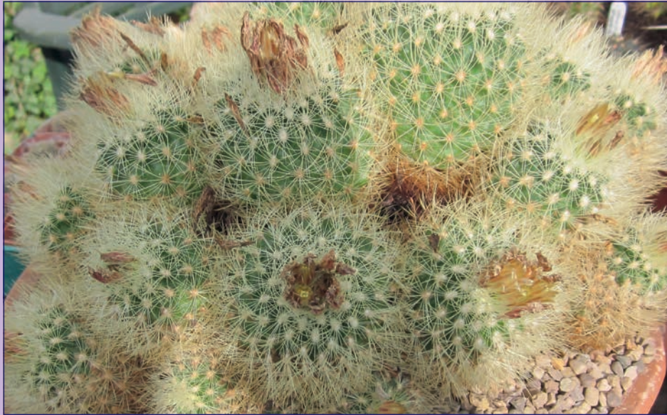
Above: Gymnocactus/Acharagma roseanum Below: Mammillaria laius