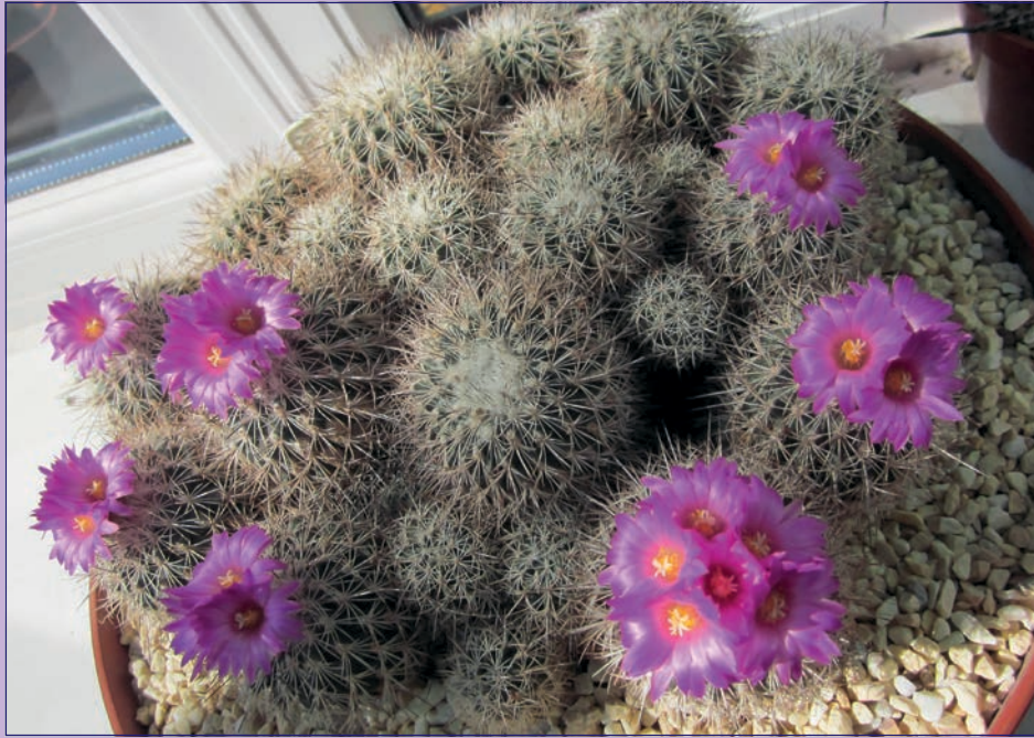
Above: Gymnocactus horripilus Below: Mammillaria/Mammilloidia senilis