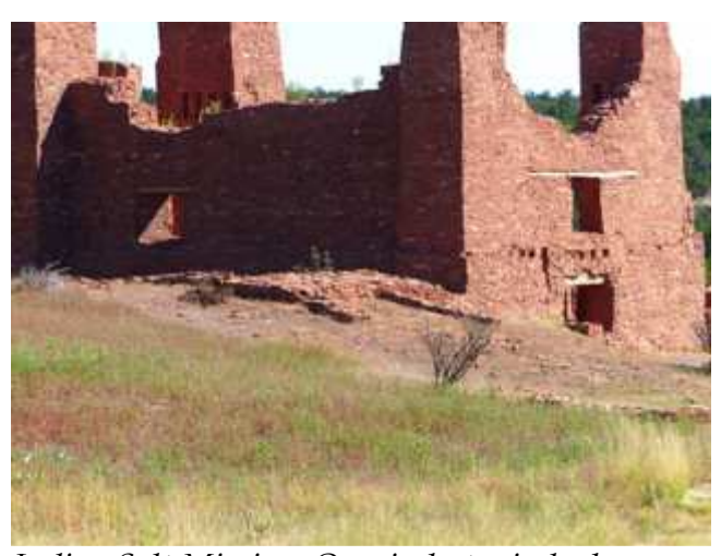
Indian Salt Mission, Quari - but mind where you walk!

intertextus, which was off the road and meant climbing a barbed wire fence. This was my first introduction to the natural habitat and it was tricky at first to find the plants, but despite the scrub we managed to find quite a few small plants. Also around were clumps of Echinocereus engelmanii and Echinocactus polycephalus. On the way back I had a slight argument with the fence - new pair of shorts needed - no damage to me thankfully (Woody said that I was now fully initiated in the perils of field work).