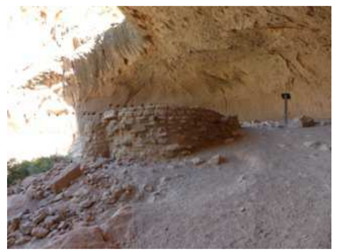
The Kiva at the Alcove house (old settlements in the rocks)

surrounding communities. The Kiva at the Alcove house was a spectacular view and worth the climb up the wooden ladders (I am not sure that Health & Safety regulations applied here).