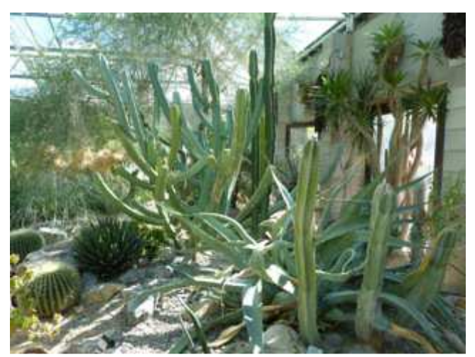
Albuquerque Botanical Garden

We continued on to Albuquerque Botanical Garden to meet Dave Ferguson (an Opuntia enthusiast - someone has got to be!) as Woody needed to talk to him about a potential presentation to a forthcoming Interstate conference. The gardens were well laid out; they even had an old fashion Train to run you around. However the Cacti and Succulent House display was a little disappointing considering the availability of natural flora.